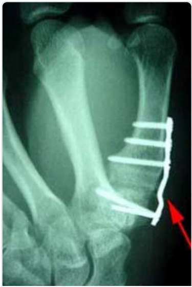
A joint fusion using a plate and screws at the base of the thumb.

The goal of joint replacement is to provide pain relief and restore function. As with hip and knee replacements, there have been significant improvements in joint replacements in the hand and wrist.